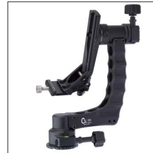
CO-001 HEAVY DUTY SUPPORT