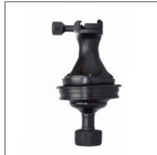
CO-013 BOWL RISER MOUNT