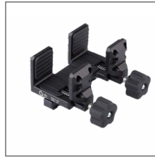
CO-004 CLAMP FOR RIFLES