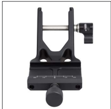
CO-011 ARCA RIFLE CLAMP